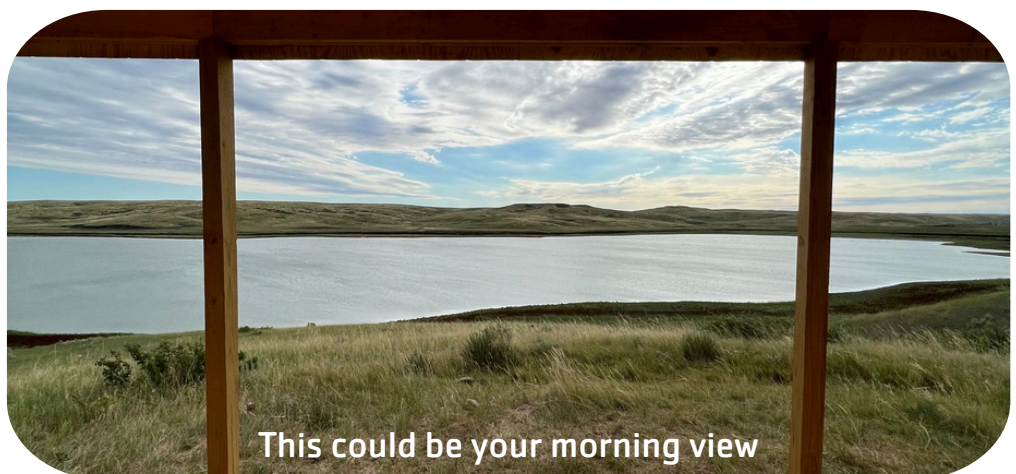
This could be your morning view